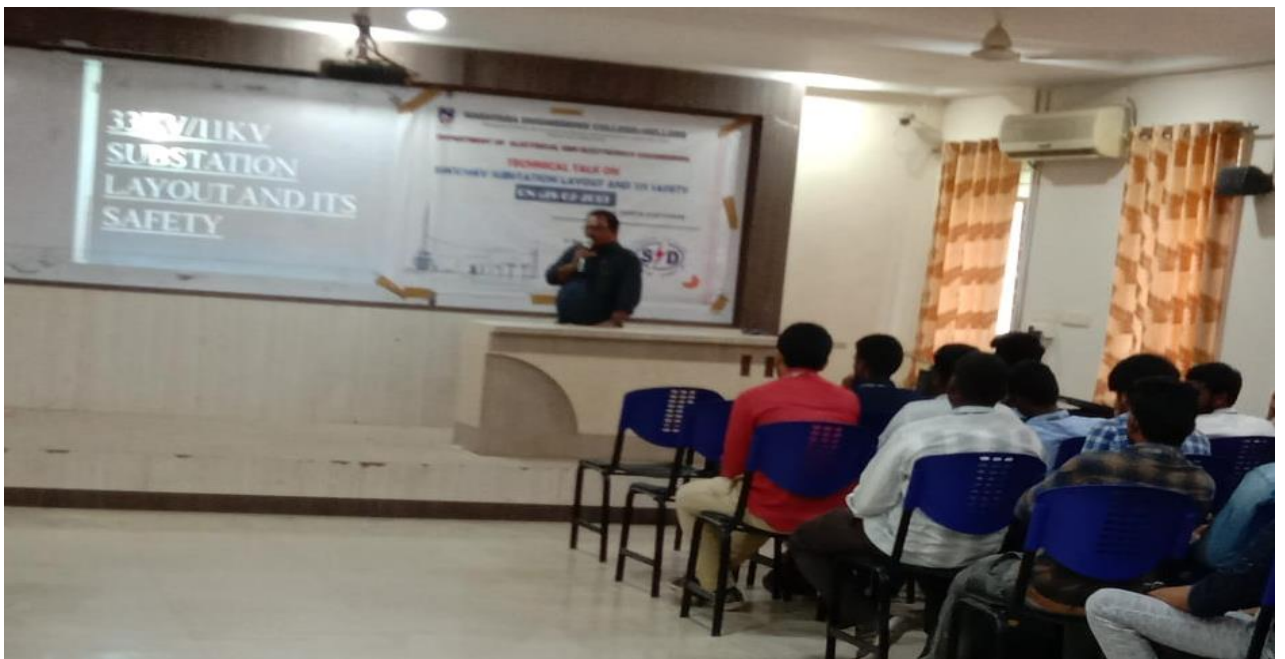
Students listening to the Technical Talk