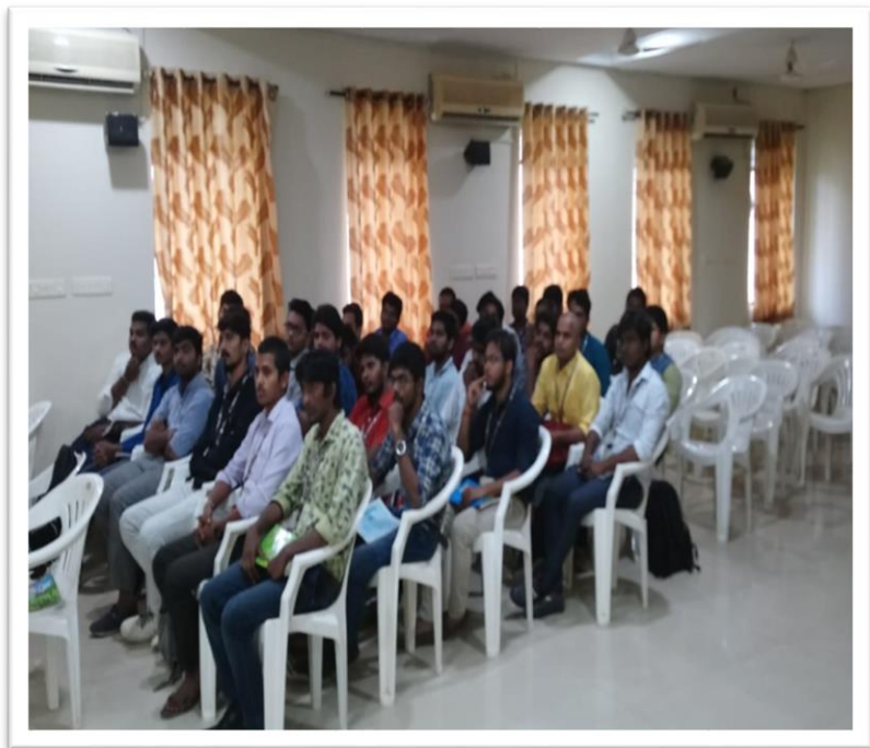
Students listening an awareness Programme