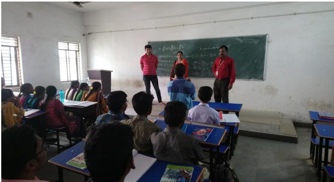
Speaker interaction with the students