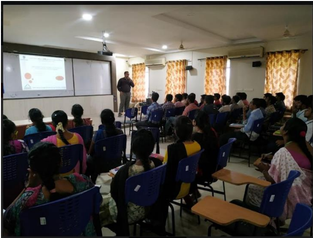
Speaker addressing about the importance on Distribution Control System