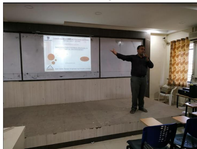
Speaker addressing about the application Distribution Control System