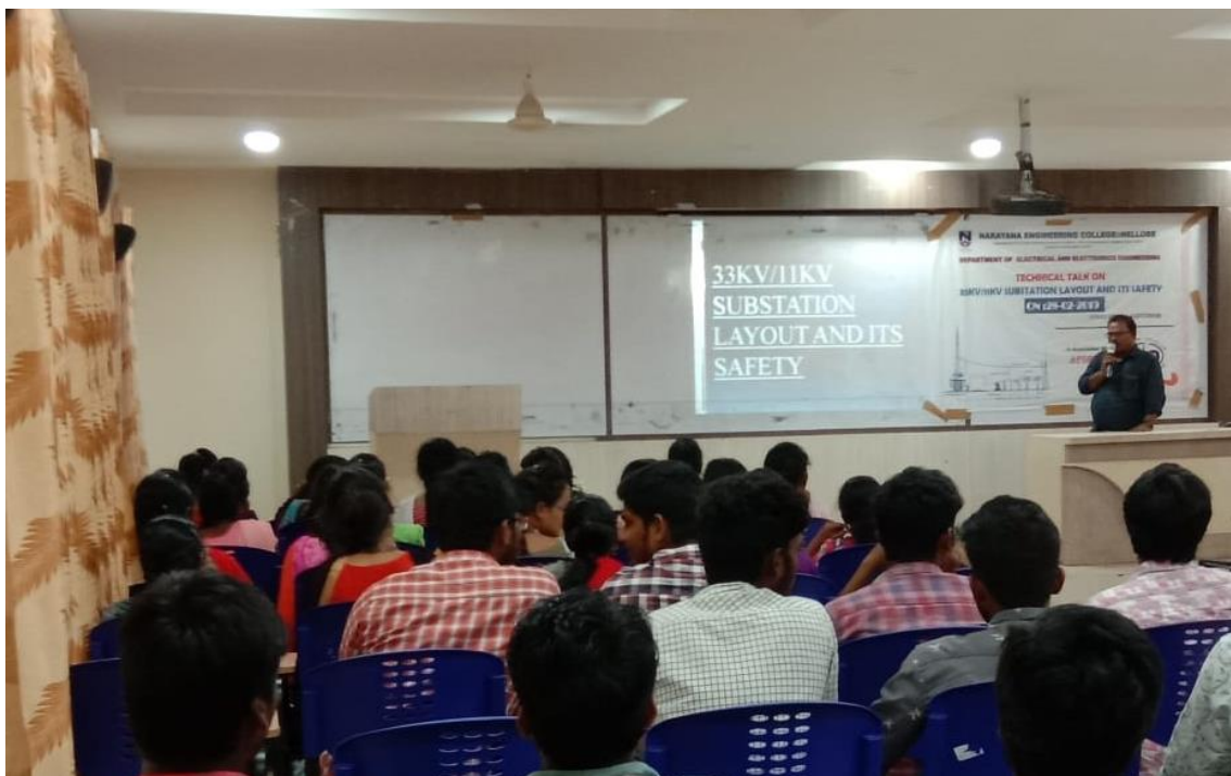
Students listening to the Technical Talk