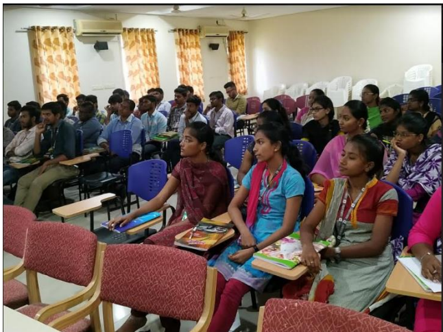
Student listening Technical Talk