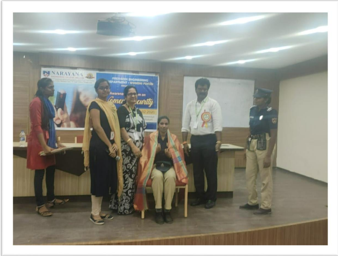
Felicitation to the Resource Persons by HOD & Women's Forum Convener