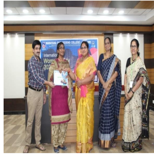
Distribution of certificate and memento for girl students