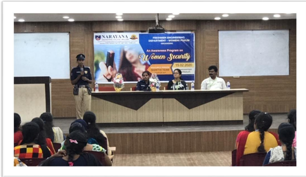
Resource Person delivering content about Women security