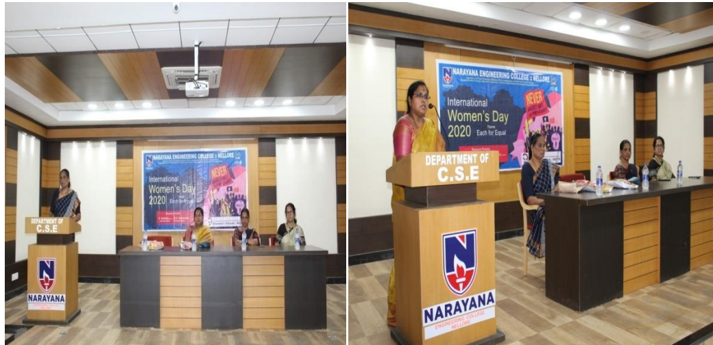
Chief guests Addressing the Gathering