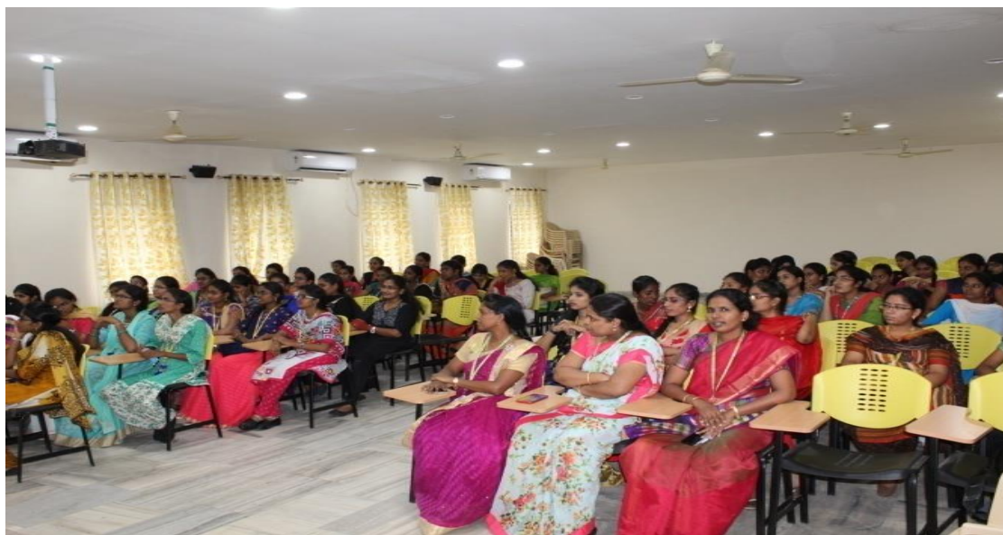
Students listening to Lecture