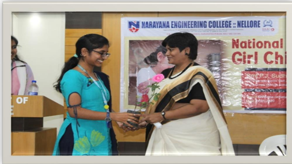
Welcome speech by the student