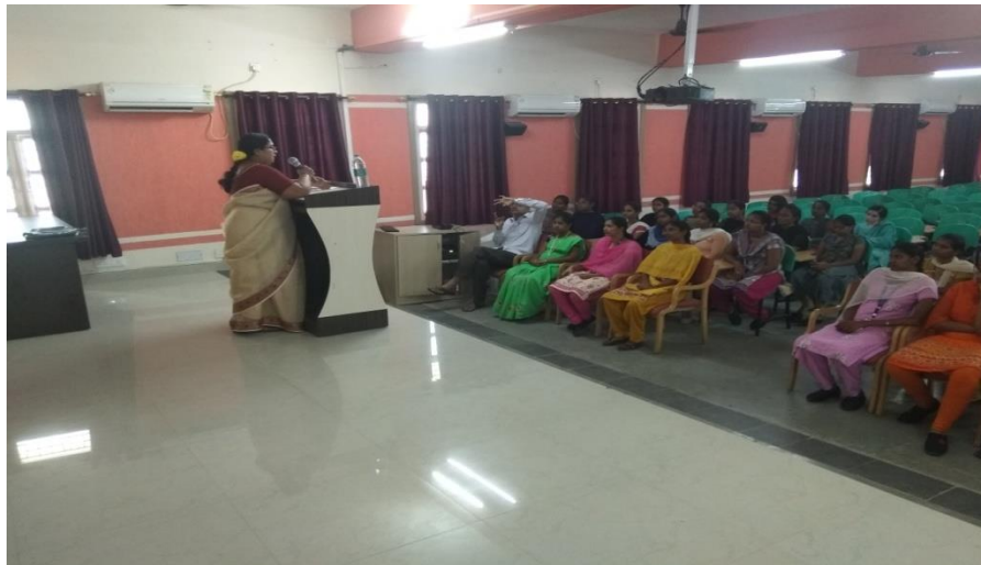
Students listening to the words of Resource Person