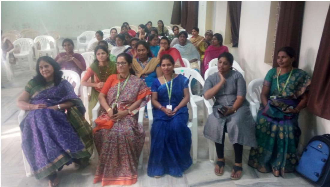
Listening to the students feedback on this session