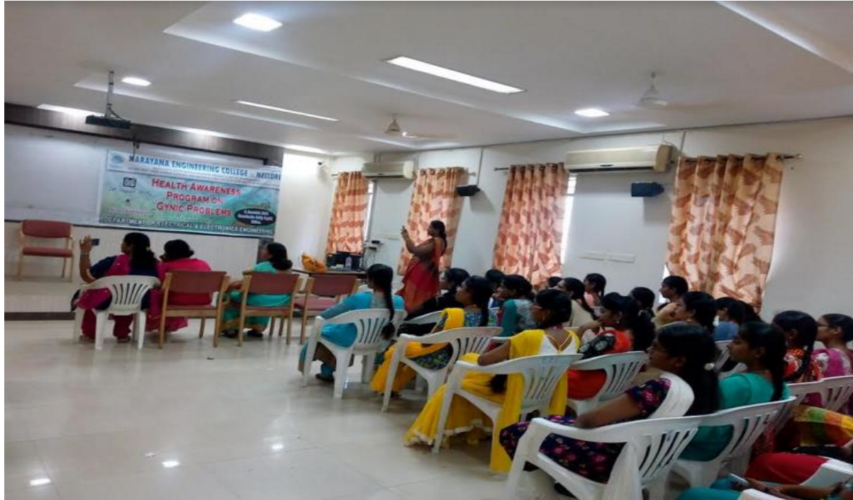
Students listening to speech