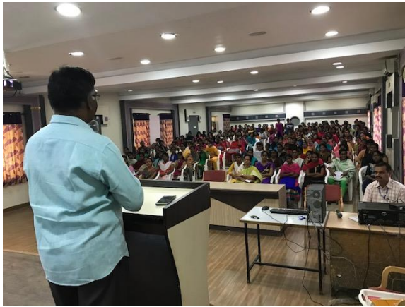
Audience listening to the speaker