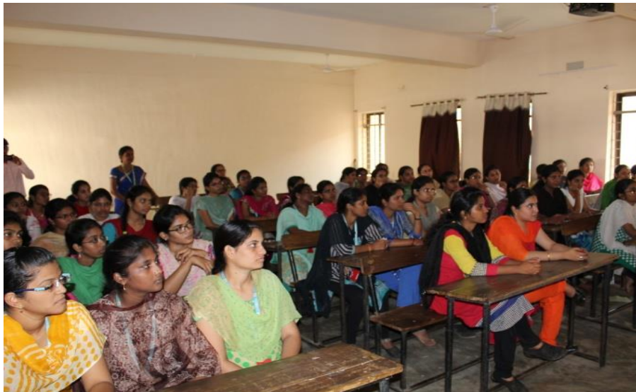
Students listening to the seminar