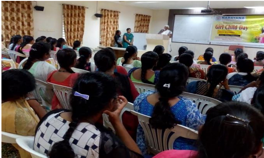
Audience listening to the speech