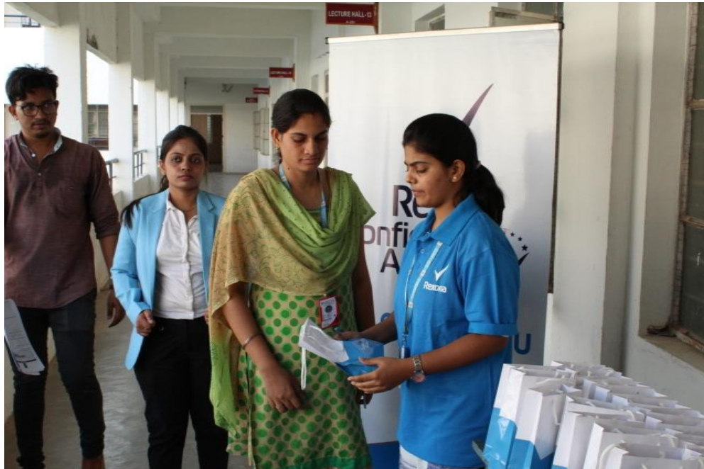
Distribution of Rexona kits to the Students