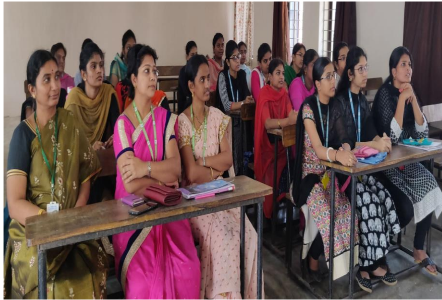
Audience listening to the speech