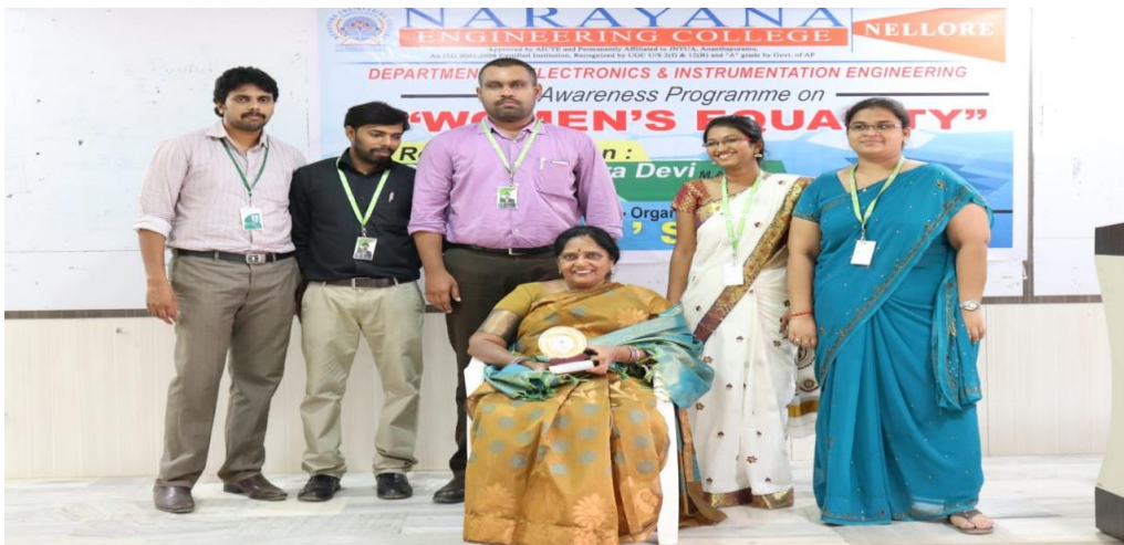
Felicitation to the resource person