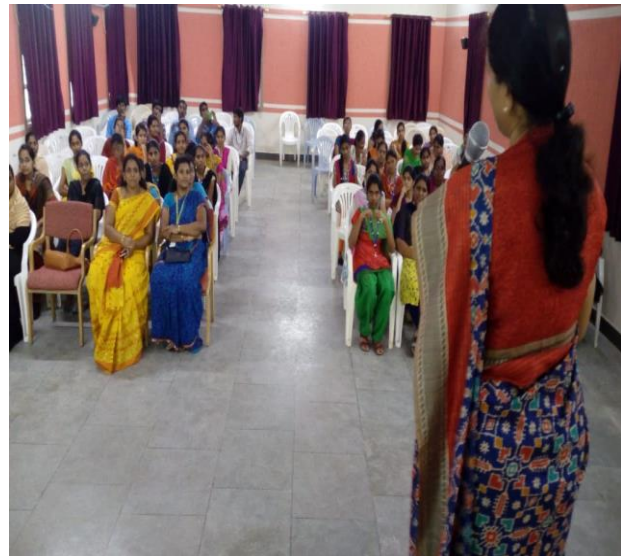
Resource person delivering the speech