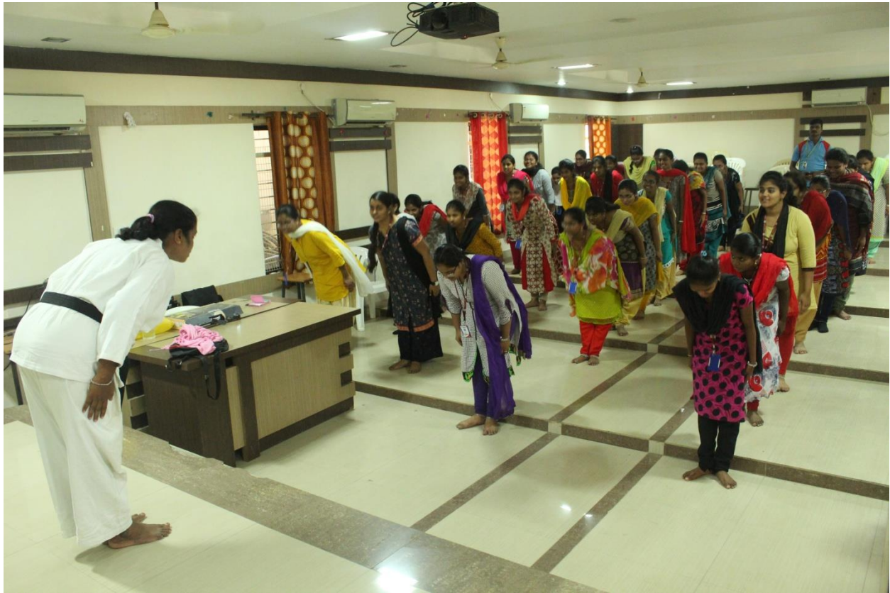
Students are Practicing the Karate