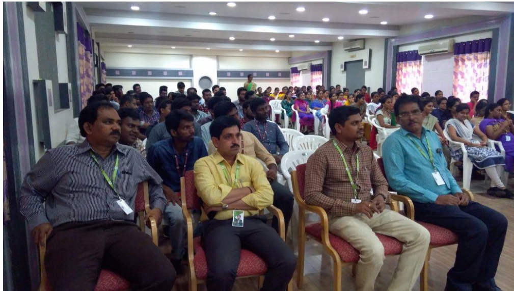
Audience attended the program