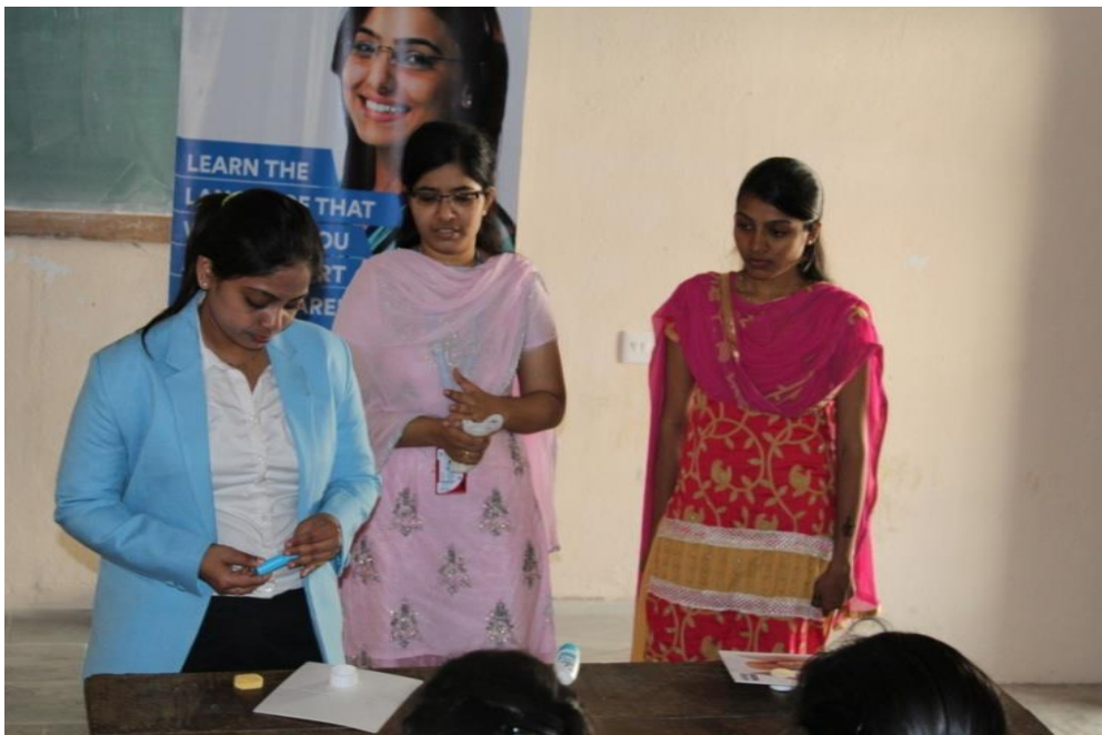
Distribution of Rexona kits to the Students