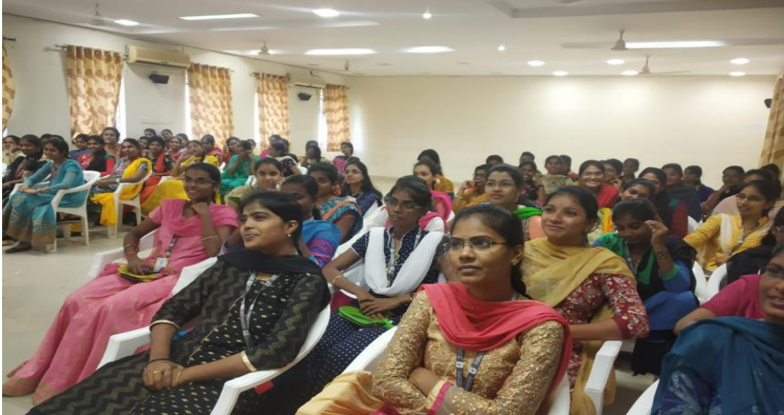
Audience Listening to the speech