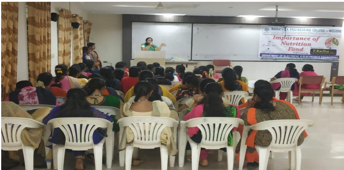
Audience Listening to the speech