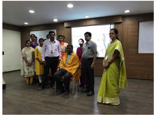
Principal & FED HOD felicitating the guest