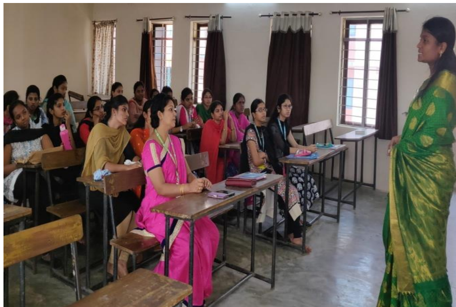
Chief guest delivering the speech