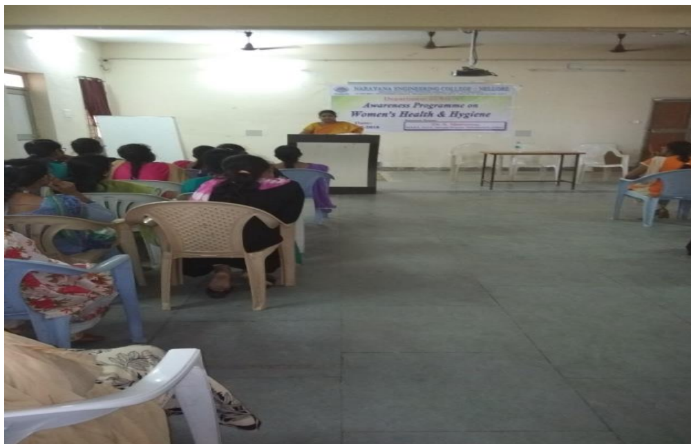
Audience intrestingly listening to the speech