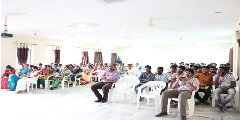
Audience Listening to the speech