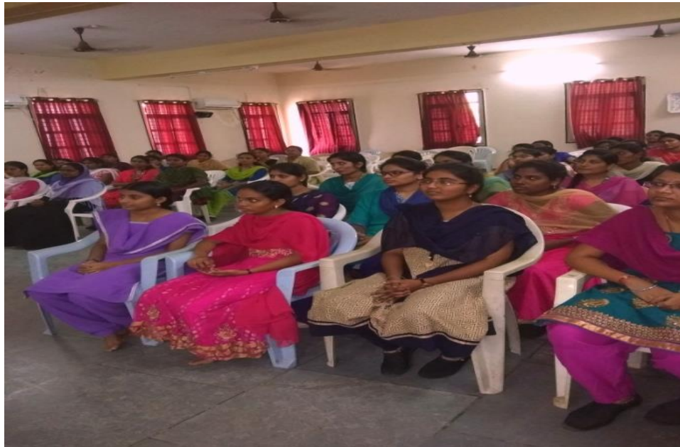
Audience intrestingly listening to the speech