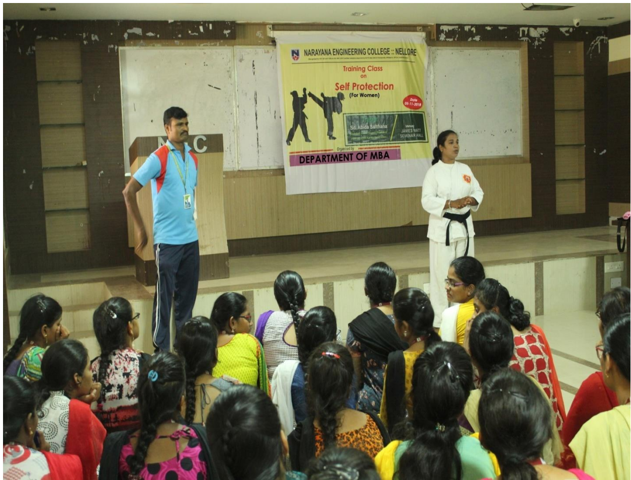
Students attending the class