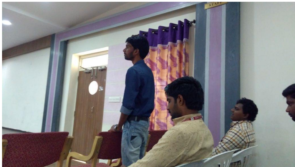
Students interaction with the speaker