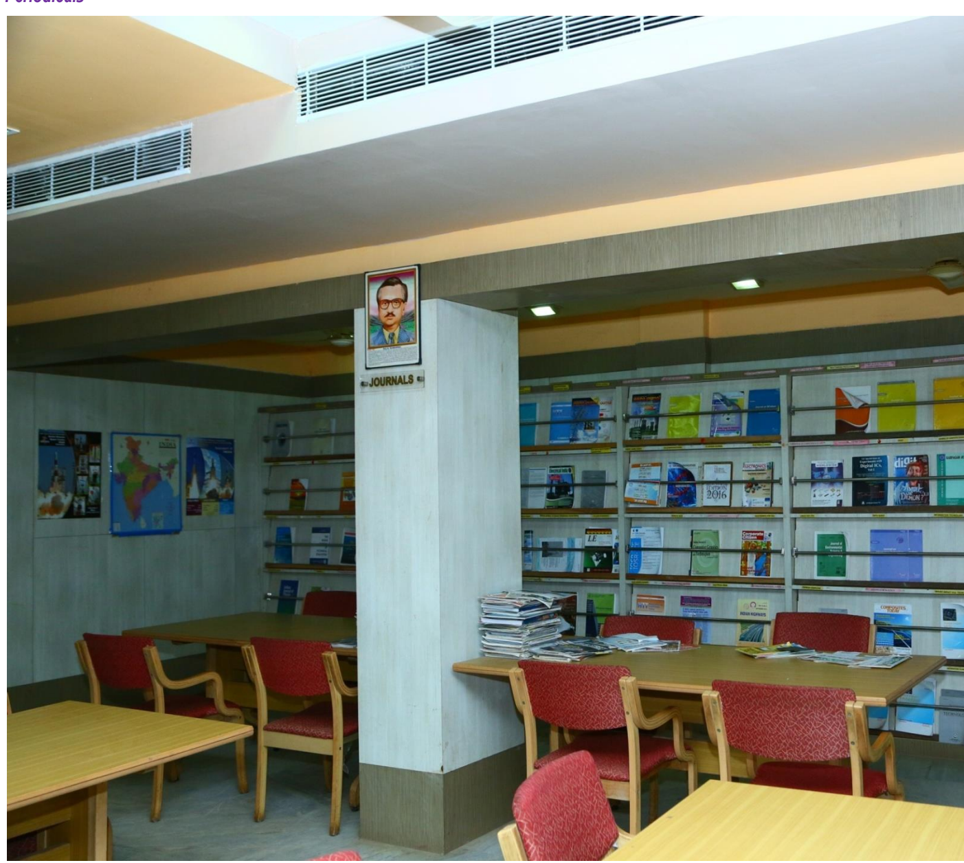
We are subscribing 85 national journals, general magazines, on-line journals (IEEE), NLIST, DELNET and '7' news papers.