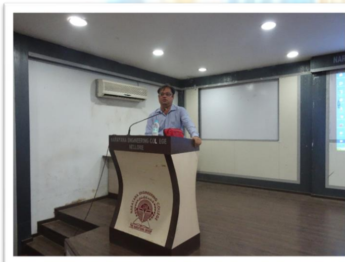
Resource person addressing the student