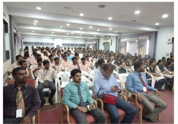
HOD and Staff Numbers and students during the seminar