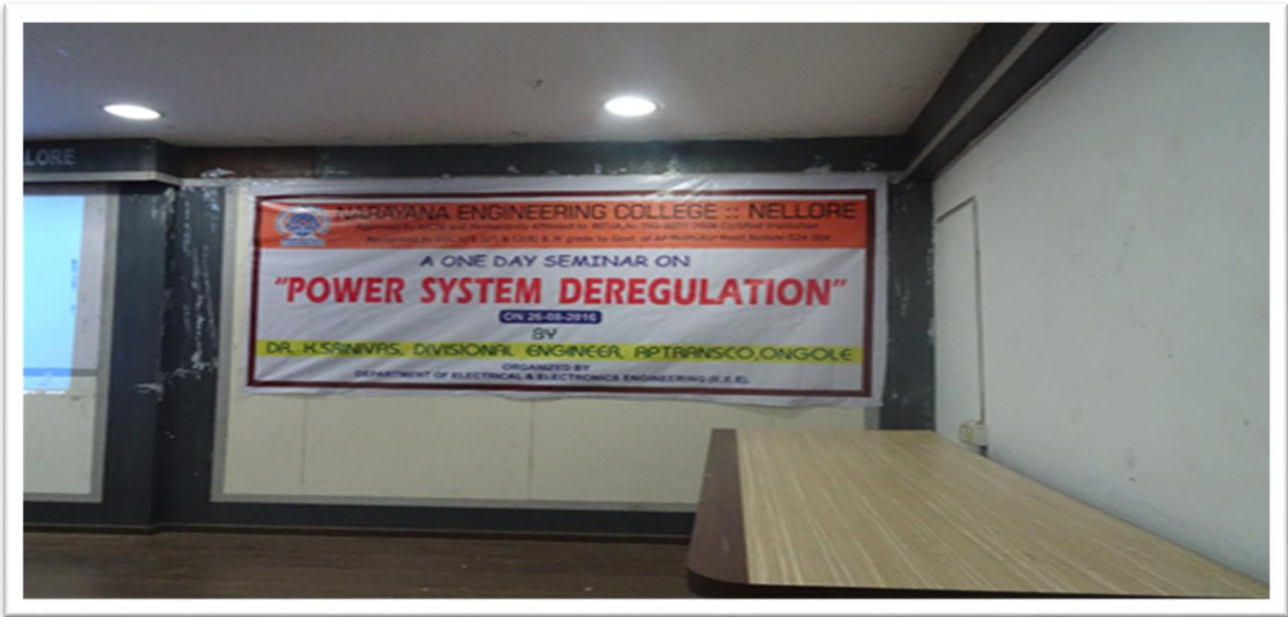
Flex for the event