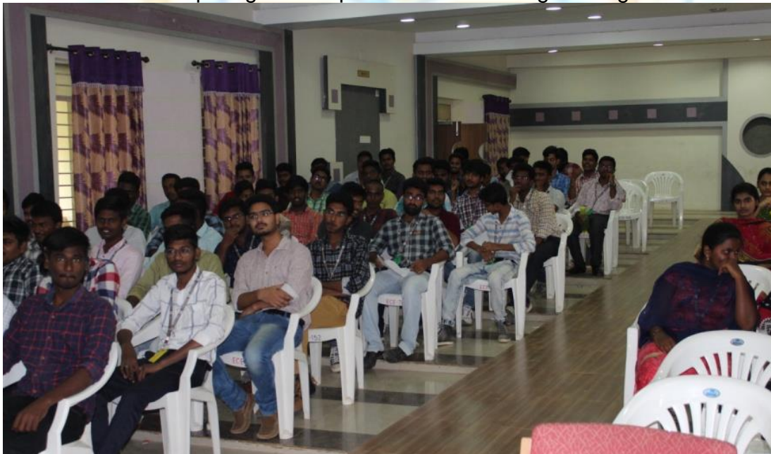
The students following the seminar with attention and interest