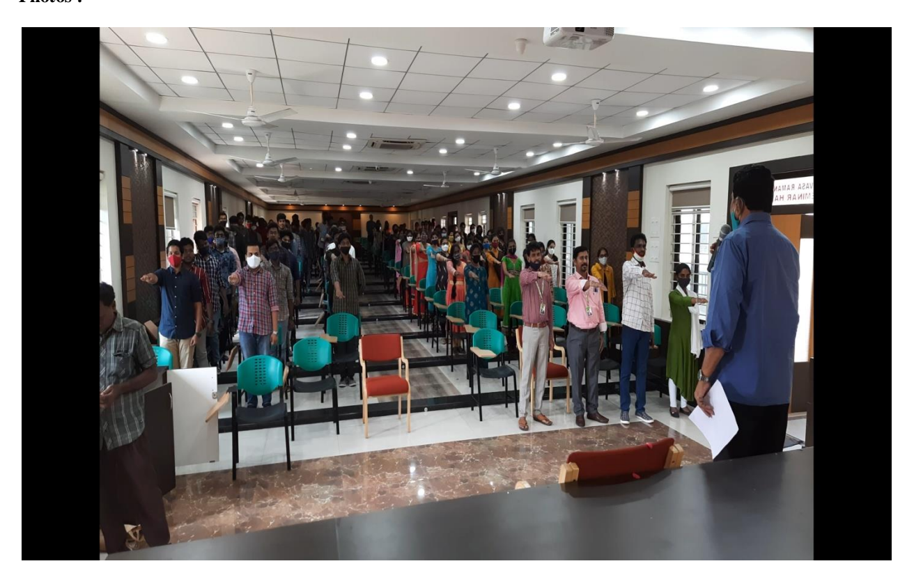
Students of NECN undertaking the Covid -19 Pledge at our campus