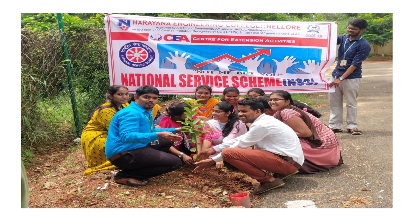
Staff and Students doing plantation at our campus