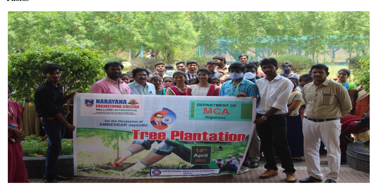
Staff and students of NECN in Plantation Program