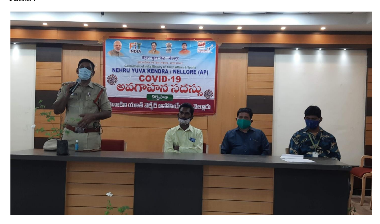
Chief Guest addressing the staff and students of NECN