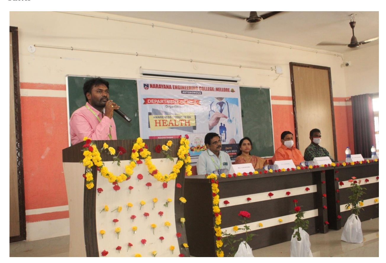
Felicitating Doctor at MCA Seminar Hall