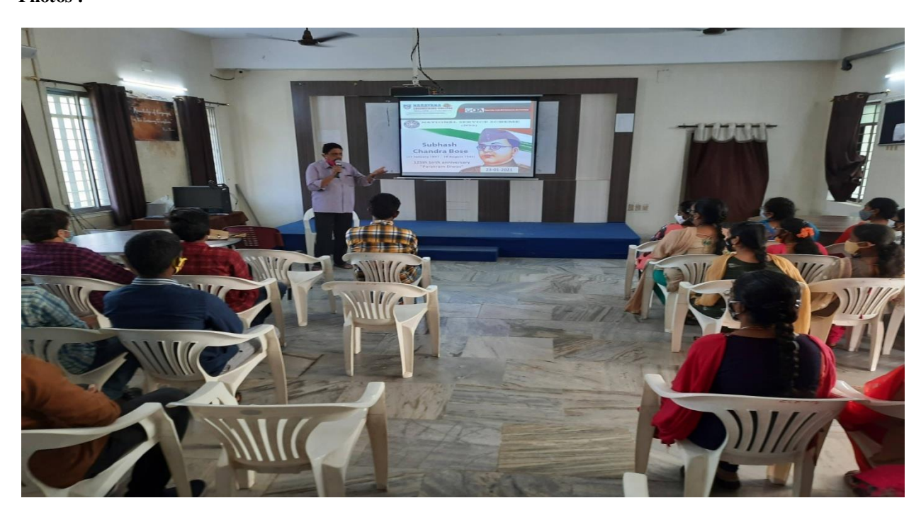
Chief Guest Addressing the gathering