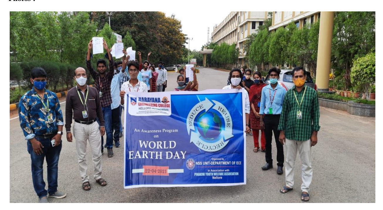
Staff and Students of NECN in World Earth Day Celebrations