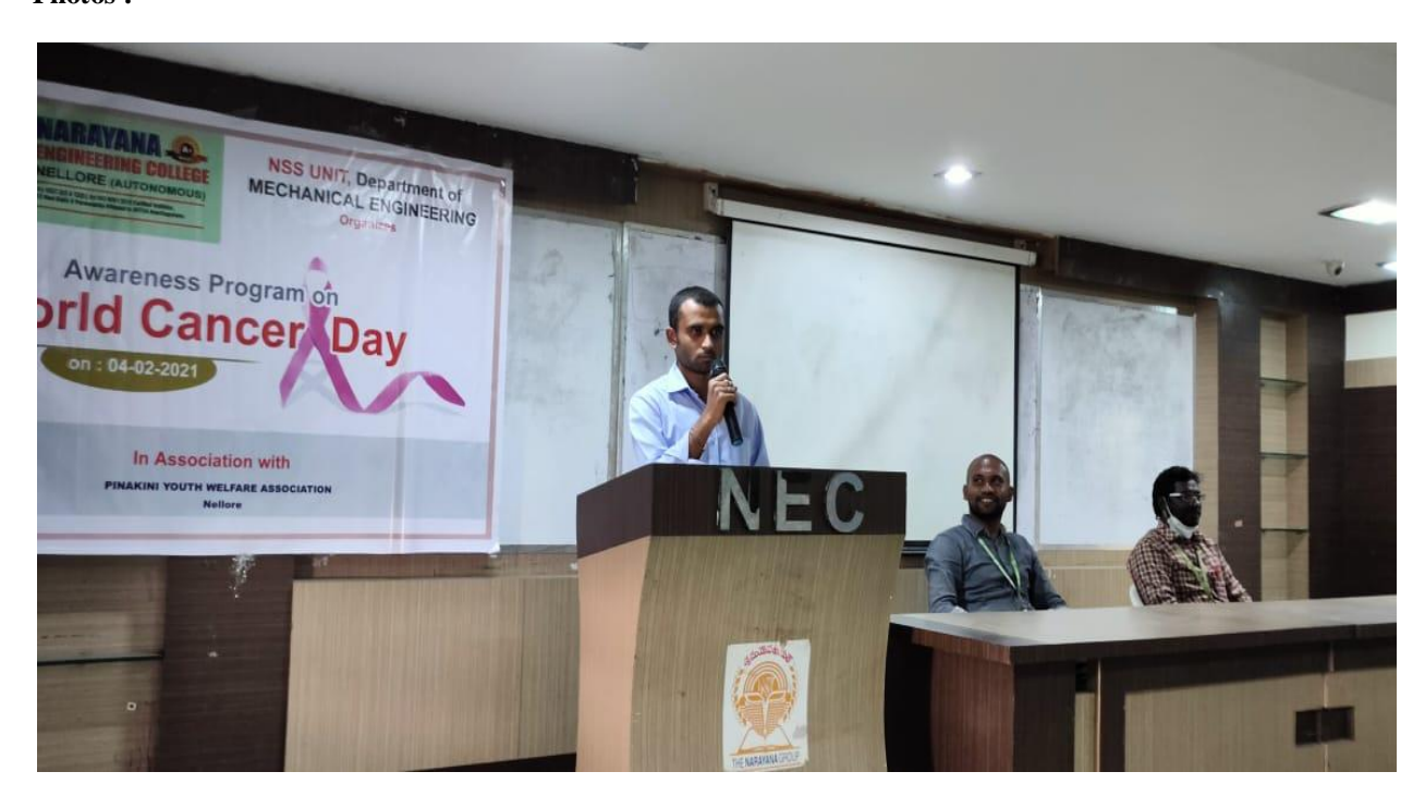
Doctor explaining the consequences of Cancer to the students of NECN